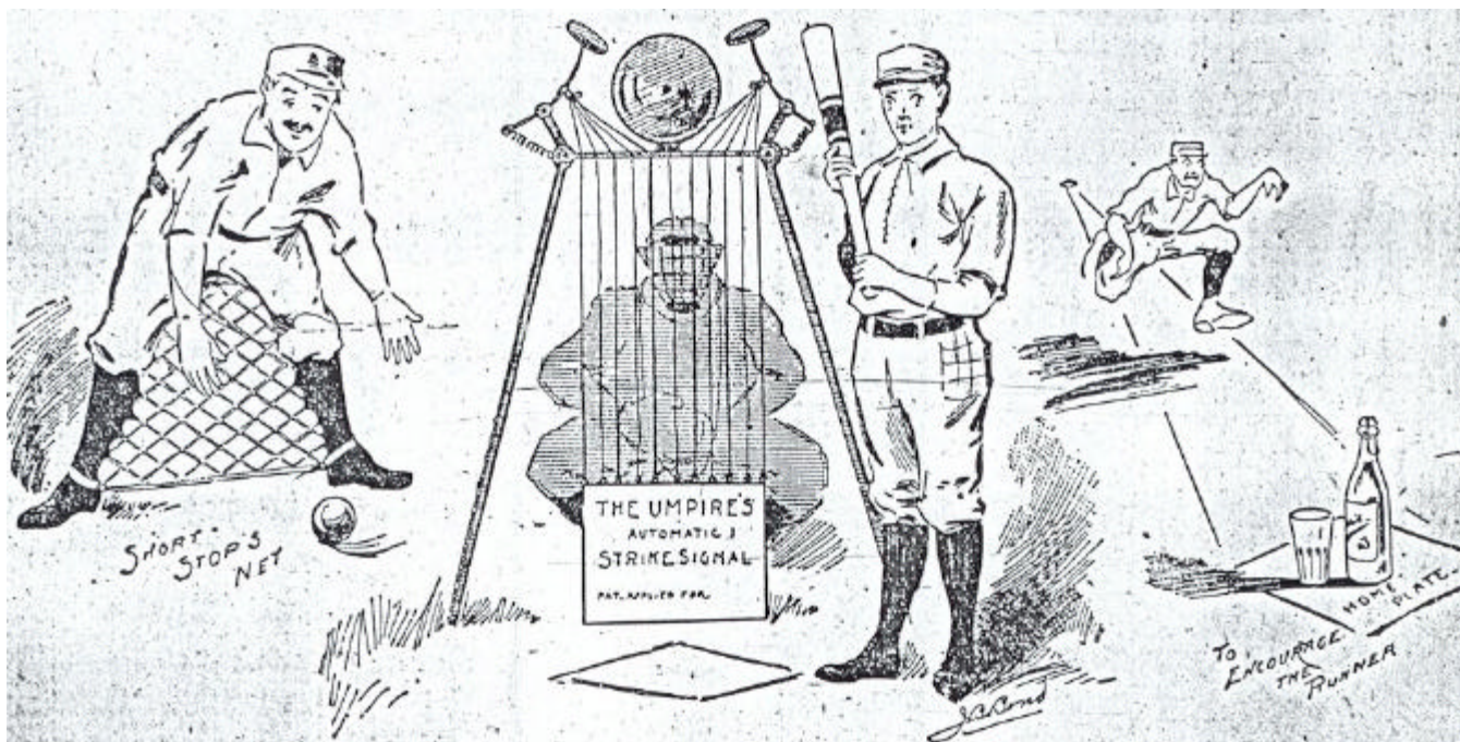
The above is part of a drawing that appeared on the front page of the 7-17-1897 issue of Sporting Life .